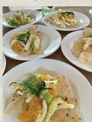
Sautéed fennel and orange salad

"For our Sailing2Wellness trips, I plan menus with a flexible, seasonal approach, taking inspiration from the Mediterranean and the Blue Zones philosophy of Sardinia. I prepare the ideas in advance but am often guided by local, fresh ingredients, adapting them according to availability and creating meals on the spot. The emphasis is on nutritious, balanced dishes that are possible to prepare in a small galley, ready to be shared between everyone."