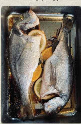
Gilt-head bream with orange and sage