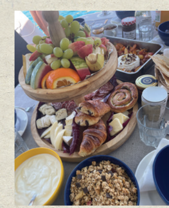
Breakfast is packed with goodness